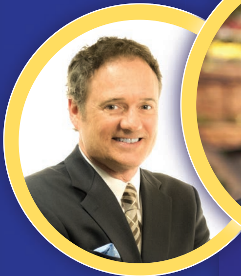
Master of Ceremonies: WALT GRAY NEWS ANCHOR, KXTV 10